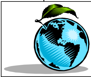
A Shrinking World has Implications for Teachers

Initially we are setting up an area in our education department where teachers and/or librarians may review multicultural children's literature, posters, workbooks, puzzles, and other instructional materials. In the future as more materials are purchased, particularly